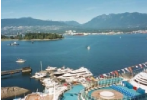
The view from the Pan Pacific

In addition to these, several educational presentations focused on enhanced technologies which affect