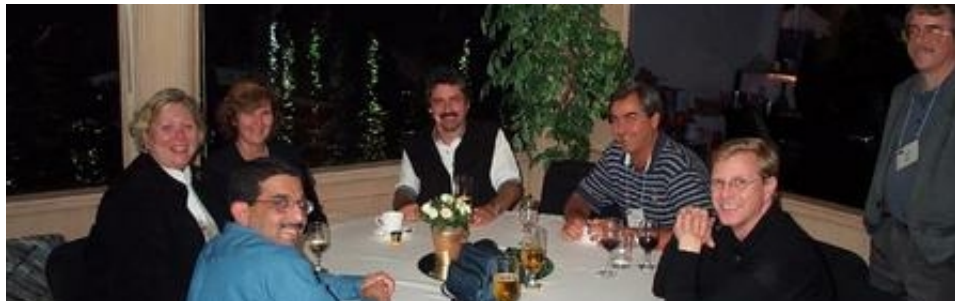
Our hosts from Telus & five friendly vendors