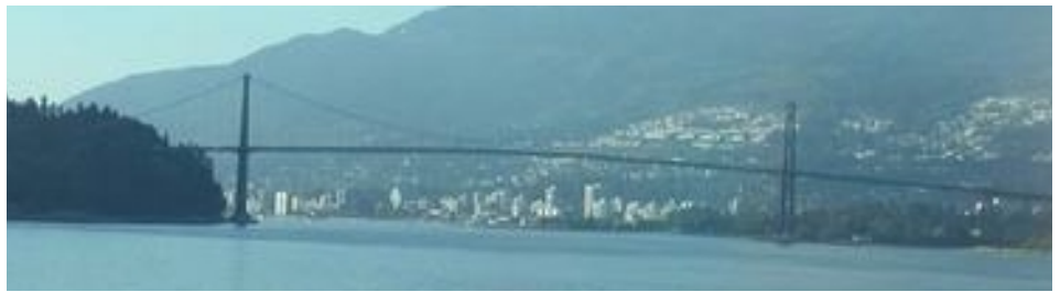
The view from the boat