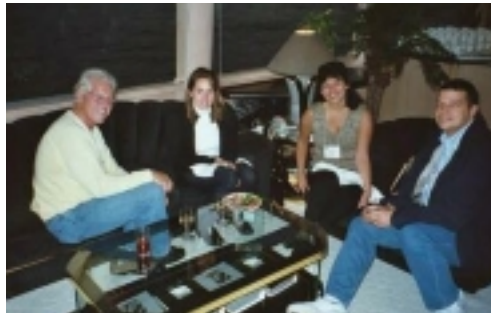
The silver fox & the student